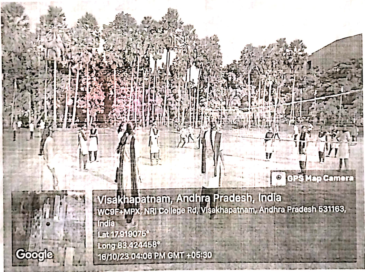
Throw ball event